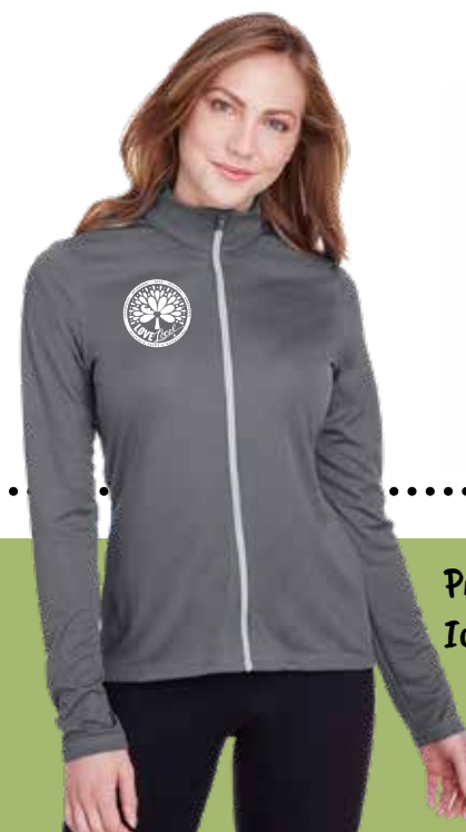
Puma Golf Ladies' Icon Full-Zip

Round Lip Balm With a unique round shape and matte finish, our yummy vanilla scented lip balm is sure to wow everyone who sees it. Available in several fun colors; Black, Burgundy, Dark Blue, Dark Green Green, Pink, Purple, Red, Royal Blue, Sunflower, White, and Yellow.