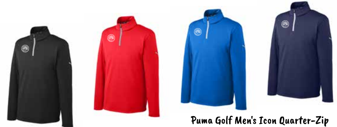
Puma Golf Men's Icon Quarter-Zip